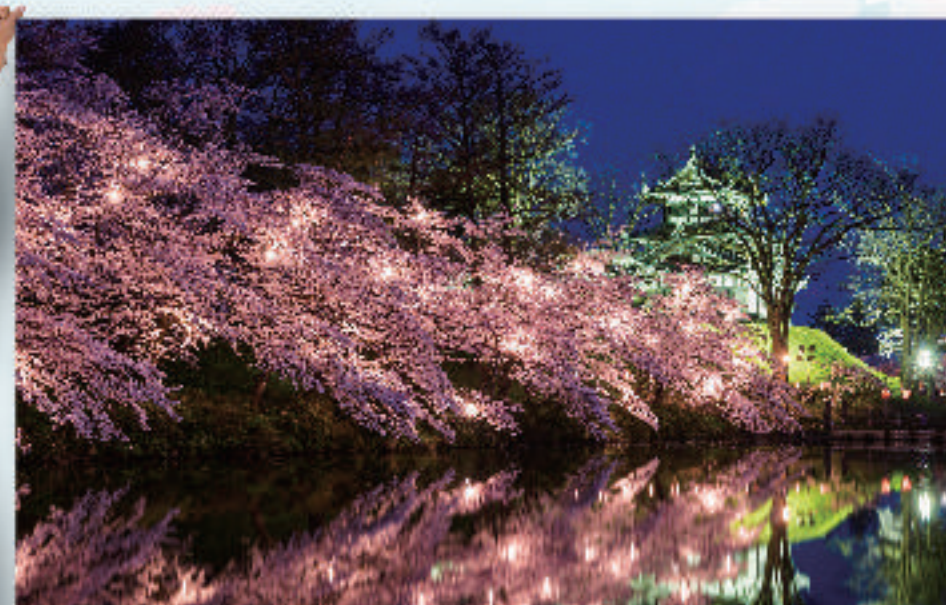
Takada castle ruin park (Sakura peak :around April 10th)