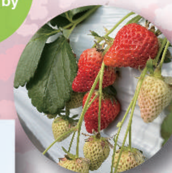
Yuzawa Ichigo mura (strawberry farm)