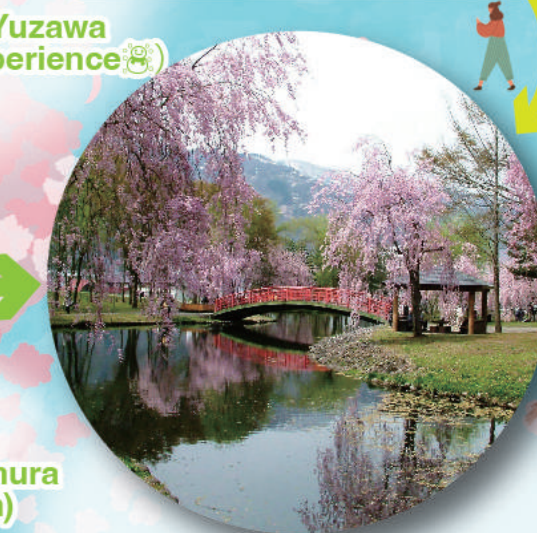
Yuzawa central park (Sakura peak:Mid~Late April)

Stay at night at Yuzawa area Ex:Syousenkaku Kagetsu