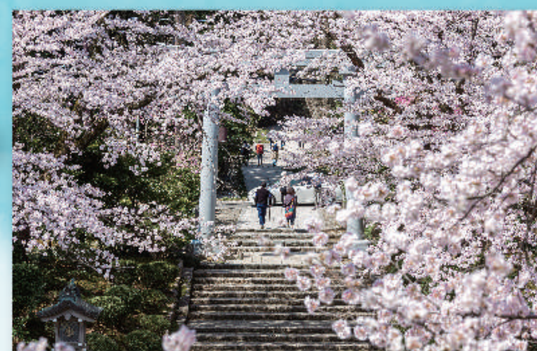
Yahiko Shrine and park (Sakura peak :Mid April)